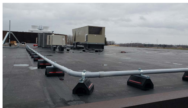
New riser system can be built, or any existing conduit system can be utilized.