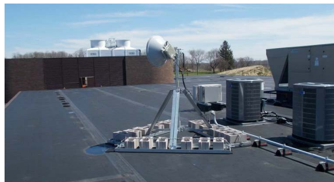
Typical installation with no roof penetration.

Since the equipment is small, so is the impact to your rooftop.