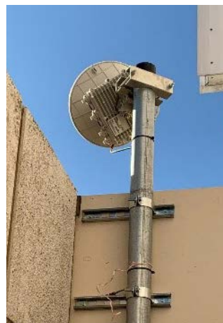
Equipment can be hidden from street view due to its small size.